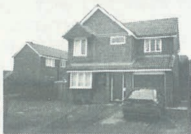
Four Bedroom Detached 9 Sunningdale - Woodham

Corner site with gas central heating. Lounge with "Louis" style fire surround; dining room with patio doors to rear garden; light oak fitted kitchen with built-in oven and hob; master bedroom with sliding mirror wardrobes and en-suite shower room; bedroom two with fitted wardrobes; tiled bathroom/WC; integral garage with parking for two cars; front garden laid to lawn; rear gardens with patio, lawns and stone wall. Early internal inspection recommended