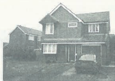
Four Bedroom Detached 9 Sunningdale - Woodham

Corner site with gas central heating. Lou "Louis" style fire surround; dining room with doors to rear garden; light oak fitted kitchen with oven and hob; master bedroom with sliding wardrobes and en-suite shower room; bedroom with fitted wardrobes; tiled bathroom/WC; integral parking for two cars; front garden laid with rear gardens with patio, lawns and stone wall. Internal inspection recommended