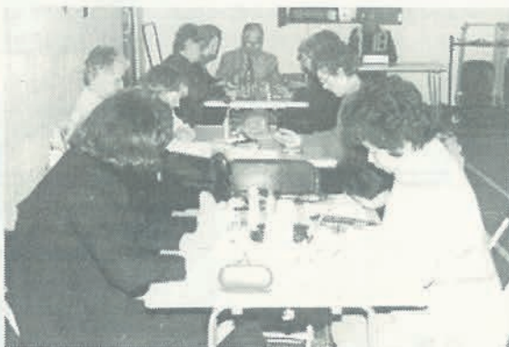
Popular Bingo Night