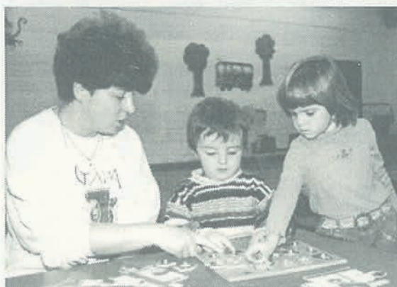
Children's Play Groups