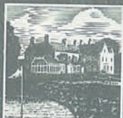
HALL GARTH Golf and Country Club Hotel

HALL GARTH GOLF AND COUNTRY CLUB HOTEL COATHAM MUNDEVILLE, NR. DARLINGTON, CO. DURHAM DL1 3LU.