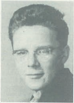
Happy 50th - Valentines Day baby, lots of love Norma and Emma