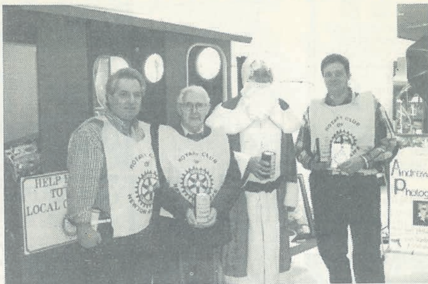
Members of the Town's Rotary Club collecting in Somerfields over Christmas to provide Food Hampers for need y families in Newton Aycliffe