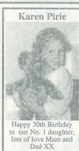
Happy 30th Birthday to our No. 1 daughter, lots of love Mam and Dad XX