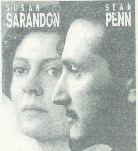
Susan Sarandon and Sean Penn

Polygram Video is proud to announce the retail of release of the award- winning drama, "Dead Man Walking", now available to buy on video. Nominated for four Academy Awards at the 1996 ceremony, this emotionally charged film relates the heart wrenching, true story of Sister Helen Prejean and her unique relationship with a convicted killer on America's death row. Starring Susan Sarandon who gave an Oscar winning performance as Sister Helen, Sean Penn who was nominated for the 1996 Best Actor Oscar and Robert Prosky. "Dead Man Walking" sparked widespread debate on the morality of the death