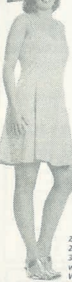
Zoe lost 20lbs in 3 months with Weight Watchers

NEWTON AYCLIFFE Woodham Com. Centre, St. Elizabeth's Close - Tues 6pm Over 60's Club Building, Neville Parade - Wed 7pm Leisure Centre, Beveridge Way - Thurs 9.30am & 5.30pm