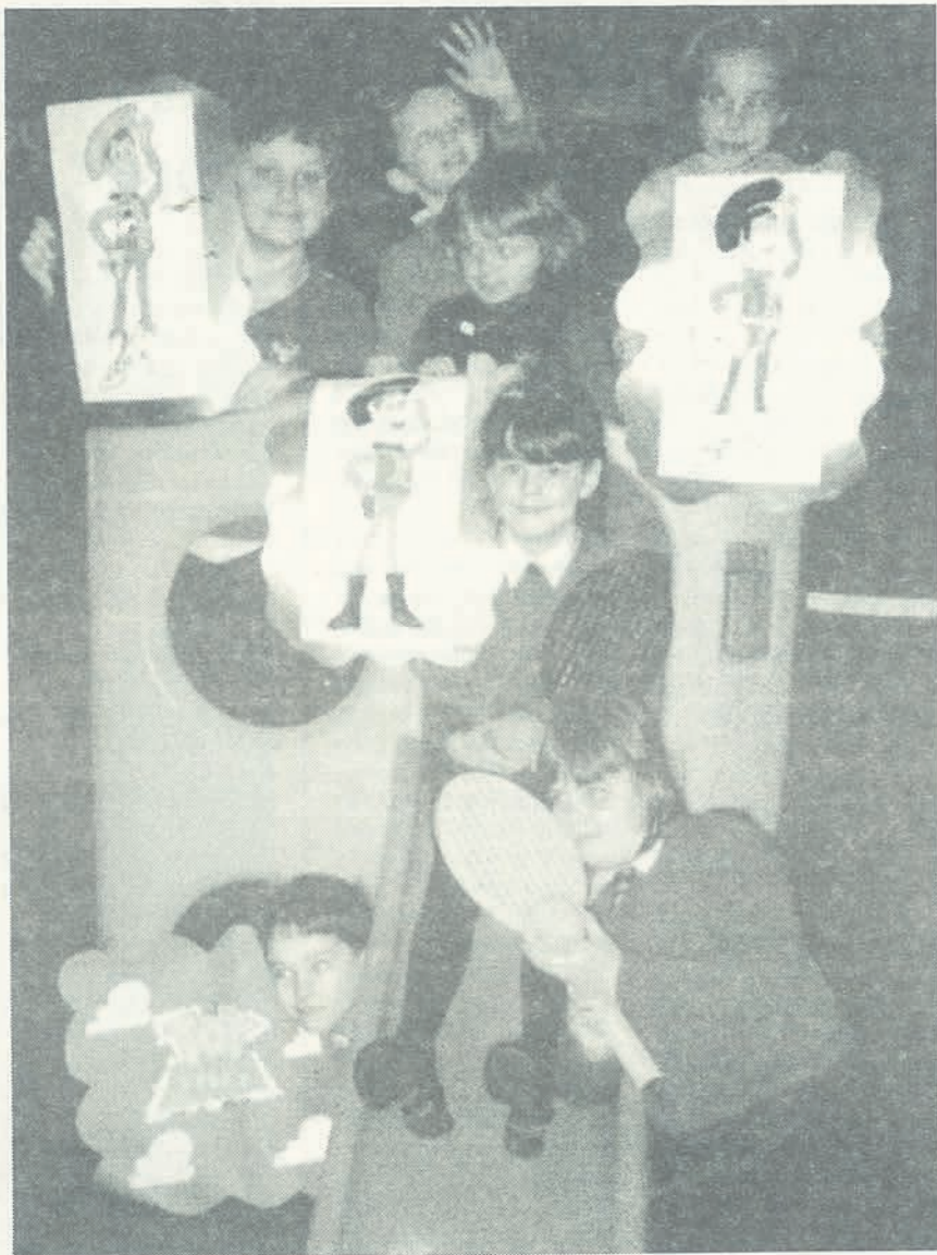
'ACTIV' After School Care at Christian Life Centre, Woodham have been enjoying their theme on 'Toy Story' this term. Children have taken part in a variety of creative activities, making rockets and badges etc. 'ACTIV' started on January 7th and provides transport from school to the Centre every school day 3pm - 6pm during term time. Refreshments are available for children on arrival. Other activities available include computers, short tennis, snooker, games etc. 'ACTIV' is funded initially by Durham TEC which has enabled the scheme to purchase quality equipment. For more information please contact Christian Life Centre, Woodham, Newton Aycliffe on 301760.