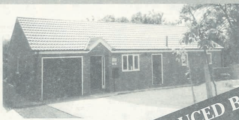
Bungalow Plot No. 46