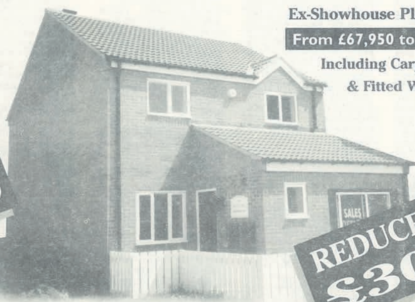
Ex-Showhouse Plot No. 56