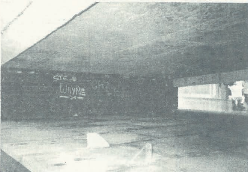
Unightly litter and graffiti under the Ramp