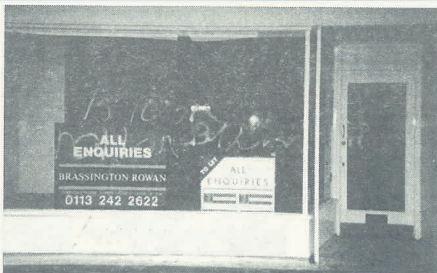
Empty shops attract vandals

Any developments will be reported in future editions of the 'Newton News'.