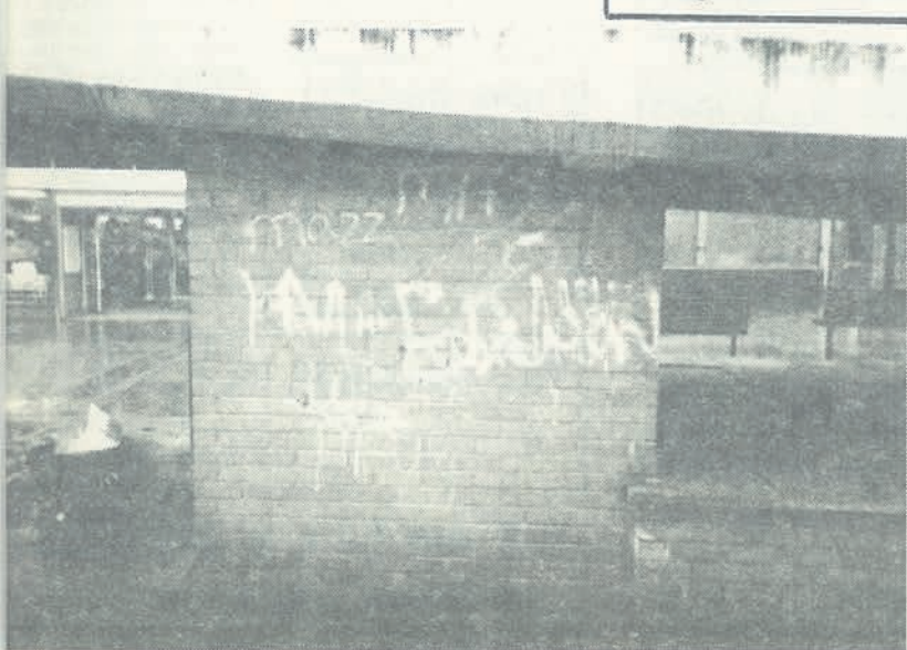
Graffiti on the Town Centre Ramp downgrades the whole area

BRING THIS COUPON TO YOUR FIRST MEETING Offer closes 15/2/97. Concessionary Members pay just £2.95. This offer cannot be used in conjunction with any other offer and is not valid in the Republic of Ireland, Northern Ireland or for At Home. Weight Watchers™ Ref: 145116 If you can't get to a Meeting, try our Weight Watchers At Home service. Tel: 01628 418500.