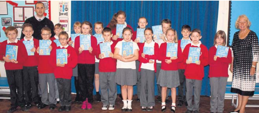
Year 6 students at Byerley Park (top) and Woodham Burn received the gift of illustrated dictionaries from the Rotary Club of Newton Aycliffe as part of an International campaign to improve literacy among young people. The dictionaries are for all Year 6 children in the area to help them prepare for the move to Secondary School next year.