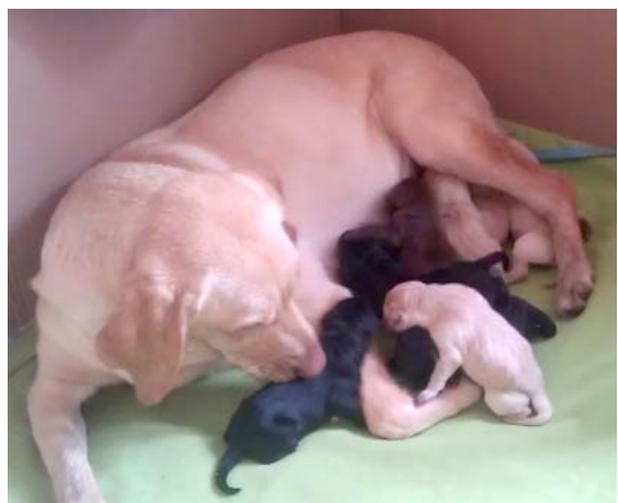
Joanne Woodward's Labrador Millie after giving birth to ten gorgeous puppies.