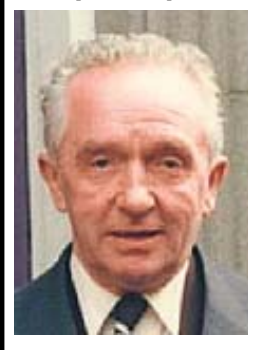
8th August Thinking of you Dad on what would have been your 100th birthday. Love and miss him always. Family and Friends

(Painter - Aycliffe Development Corporation)