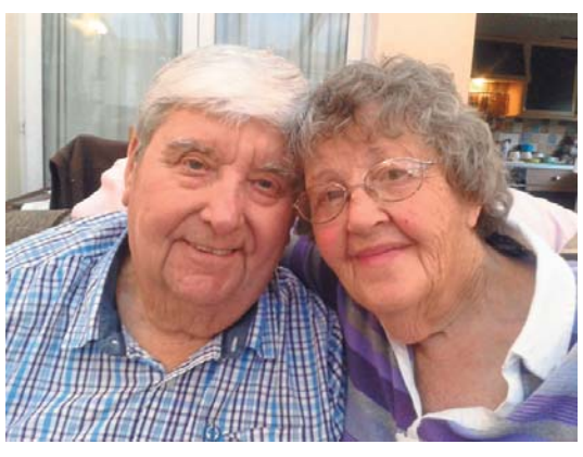
Emerald Wedding Anniversary (55 years) 8th August Best wishes from all your family and friends