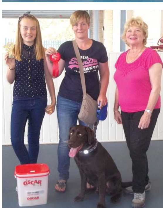
Best in Show