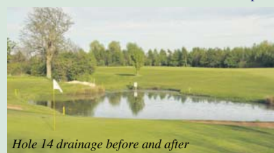
Hole 14 drainage before and after