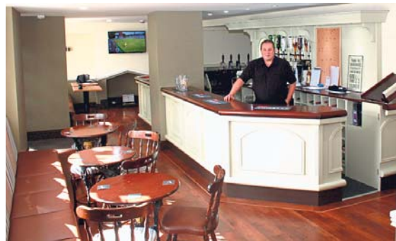
Former Bar Manager at the George & Dragon in