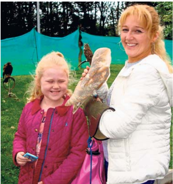
Autism Society and their Family Support Services please contact them on 0191

410 9974 or check out their website at www.ne-as.org.uk .