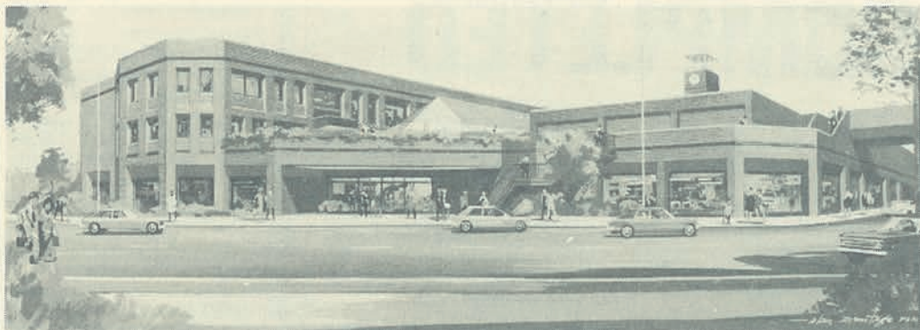
An artist's impression of the office and shopping complex and public house which are to be built on the site of the old town centre roundabout.