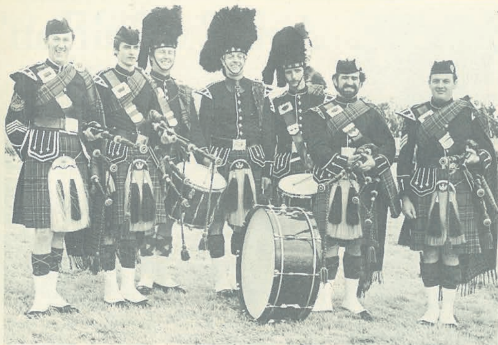
A section of the Newton Aycliffe Pipe Band.