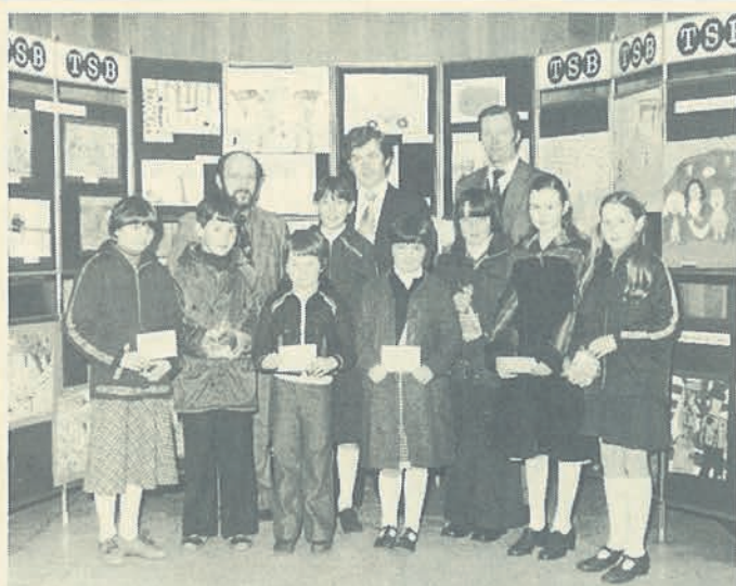
Children who took part in a painting competition sponsored by the Trustee Savings Bank, seen collecting their prizes.

HOUSEHOLD ALTERATIONS . Any job considered, alterations, brickwork, concreting, joinery, fitted wardrobes, windows. Tel. Aycliffe 312128, 313276.