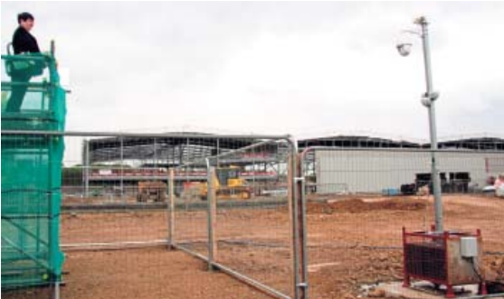
Mayor Wendy Hilary scans Hitachi's new factory

to your front door for free by a friendly, local delivery driver and stack neatly in the freezer. When you're ready to eat, simply remove a meal and pop it straight in the microwave or oven. As well as being quick and easy, the Wiltshire Farm Foods' service is also completely commitment-free - customers can order as much or as little as they like. Enjoying life and eating well has never been easier. For more information about Wiltshire Farm Foods in County Durham, you can contact 01388 765500 or visit wiltshirefarmfoods.com for a free brochure.