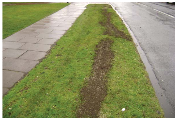
Repair to damaged verge completed after 3 months

About ten days ago, with a heavy heart, I contacted our Labour Party MP, Phil Wilson's Office. They immediately wrote to DCC and the response was electric! Nearly three months after my initial request for action, workmen arrived hotfoot at my door asking me where the damage was. They had been looking on the wrong side of the road so I showed them and they have now repaired it (leaving other damage caused by other vehicles, unrestored). DCC have now contacted Tesco and are in negotiation as to paying for the repair to the verge. What sort of signal does this send out to the Public, about the sheer futility of reporting damage to our environment? I know that Mrs Jewell wrote to the Newton News, at her wit's end about similar damage in her street. A Councillor's polite requests are ignored for twelve weeks. This is about customer service, courtesy and a failure to connect with the public. Thank you, Derek Atkinson Town Councillor for Simpashire Ward.