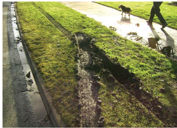
Delivery van leaves verge in bad state

Dear Sir, On January 3rd 2014 - along with photos and details of the Tesco vehicle involved - even the driver's manager's telephone number, I emailed the Highways Action Line, Durham County Council, to report damage to the grass verge caused by this van, near the Vet's surgery, in Shafto Way. A photograph showing the damage, under the heading: 'Caught in the Act' was in the Newton News. It showed the deep damage. Tesco's depot, in Durham City, told me that their insurance would cover the damage, once DCC had contacted them. All of this I left in the hands of Durham County Council who promised to respond within two days. I waited and nothing happened, so I wrote again - and then again. I did not receive a reply, save an automatically generated response. I informed all those that needed to be informed, from January 3rd onwards. What really disappointed me was that I had furnished the County Council with everything needed to get the damage repaired - and Tesco would pay!