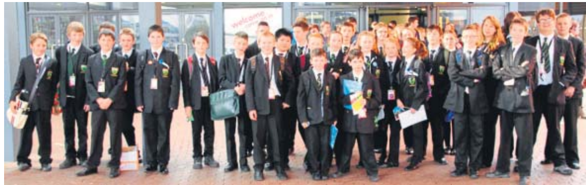
Last week students from club (Science, Technology, Greenfield College's STEAM Engineering, Arts and