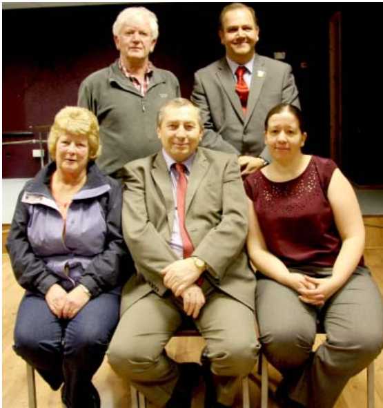
Friends of West Park officers