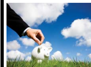
Advice you can Trust

We provide advice and planning services for people who want to make the most of their financial arrangements. We're Independent, which means we work for our clients interests, not those of a bank or insurance company. Once we've understood your aims, aspirations and concerns, we can help you make your money work for you.