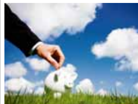
Advice you can Trust

We provide advice and planning services for people who want to make the most of their financial arrangements. We're Independent, which means we work for our clients interests, not those of a bank or insurance company. Once we've understood your aims, aspirations and concerns, we can help you make your money work for you.