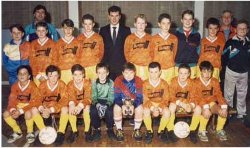
The original Youth Football Club in 1989

Newton Aycliffe Youth Football Club is planning a season of celebrations for achieving 25 years of football provision for young boys and girls from the town.