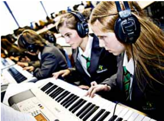
Woodham Academy students once again achieved

outstanding GCSE results in Music, with 89% of students being awarded A*-C grades. This success is not just the result of excellent teaching. Woodham Academy students benefit from an extensive range of opportunities to perform. Last year, these included annual Christmas and summer concerts, various performances in the local community and the musical "We Will Rock You" which played to a packed hall for 3 nights in March.