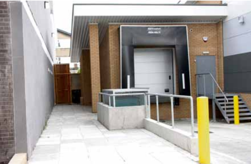
Barrier between Aldi and Coffee Pronto