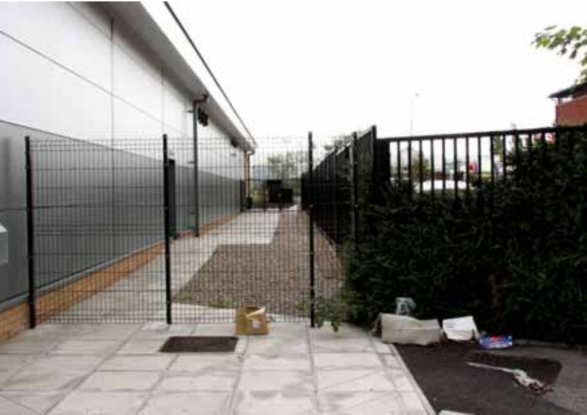
Fence at the back of Aldi cutting off a footpath between the shop and Magistrates Court Fence