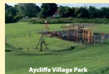
Aycliffe Village Park