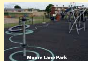
Moore Lane Park