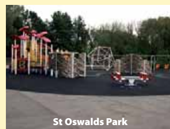
St Oswalds Park