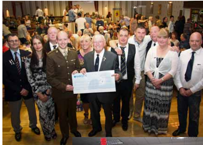
See more images of this great night on our website www.newtonnews.co.uk