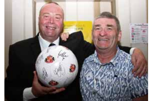
Friendly rivals for the Signed Sunderland FC football