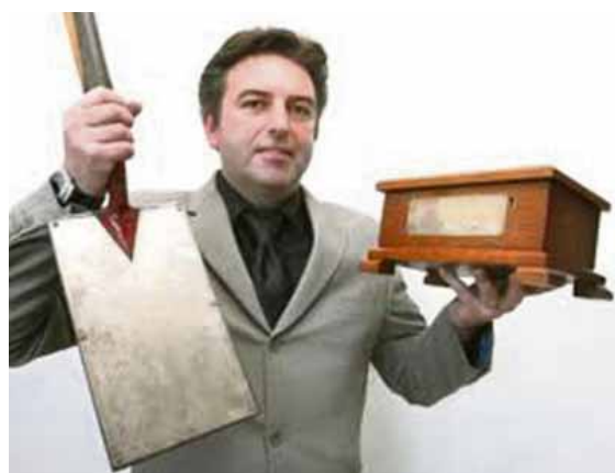
The spade and first sod were found in the attic of a former Town Clerk during a police investigation.

Council Offices having being retrieved as "lost" a few years ago. A special cabinet displaying the spade and other artifacts are available to view on request by calling at the offices on School Aycliffe Lane.