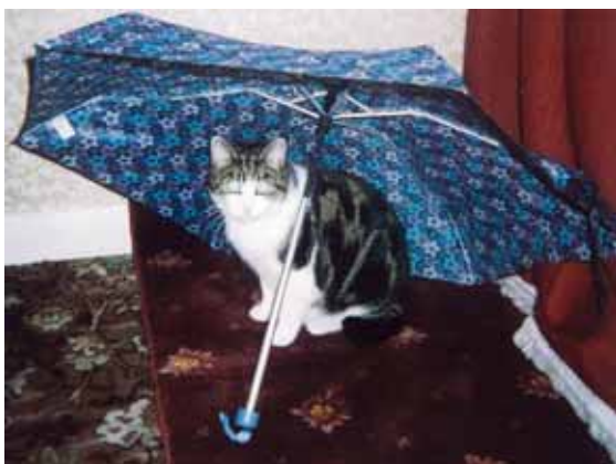
"Maisie" is ready for all weathers