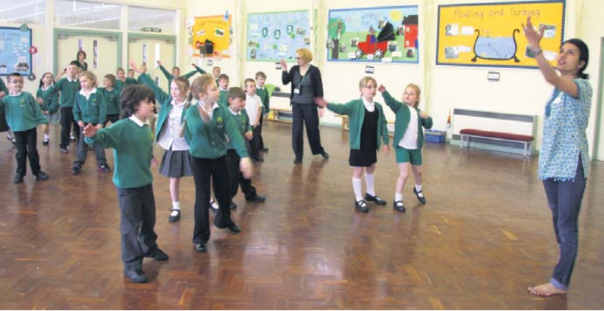
An Indian Dance Teacher was invited to teach the art to students at Sugar Hill Junior School last week. The children were fascinated by the unusual music, but responded well learning many of the special movements and enjoying themselves immensely in the process.