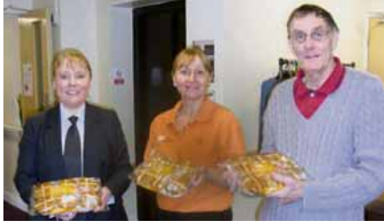
The Manager and residents of Defoe Court would like to thank the Co-operative Funeral Service for their kind donation of Hot Cross Buns over Easter