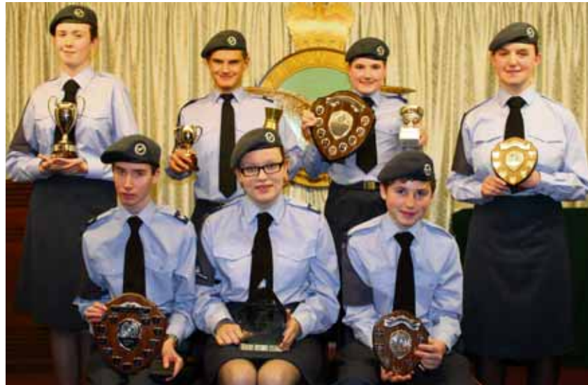
Main award recipients – Cadets with their trophies for the 2012 awards