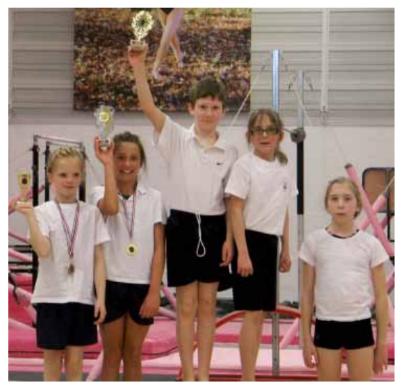
Team Champions - Aycliffe Village

The results were a triumph for Byerley Park and Aycliffe Village who shared the all-round team trophies and had individual gymnasts scoring well and gaining medals.