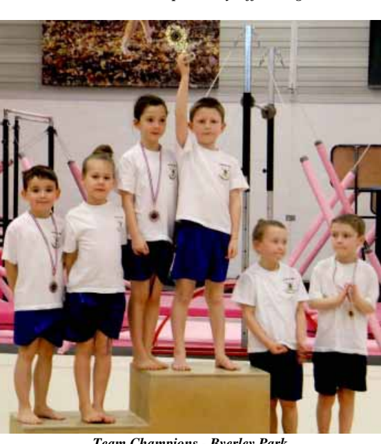
Team Champions - Byerley Park