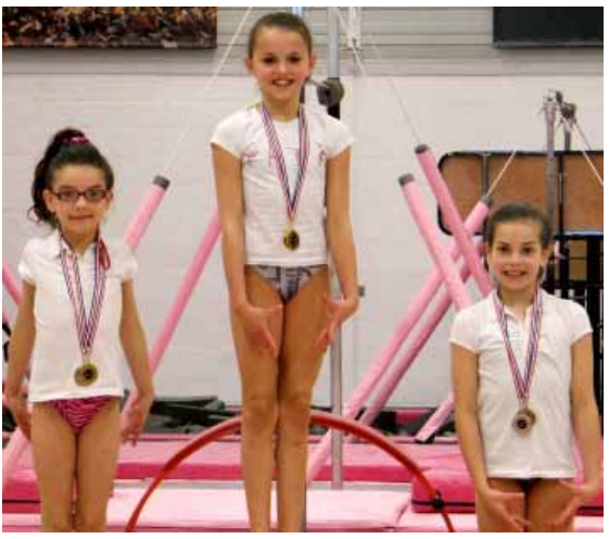
Individual Champions - Aycliffe Village