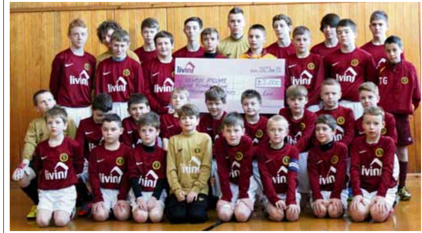
NAJFC Under 9's, Under 10's, Under 13's and Under 15's

Newton Aycliffe Junior Football Club has received £2,000 sponsorship from Livin. The money sponsors the Under 9's, Under 10's, Under 13's and Under 15's for this season and into 2014.