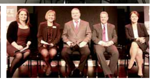
Panel answered questions