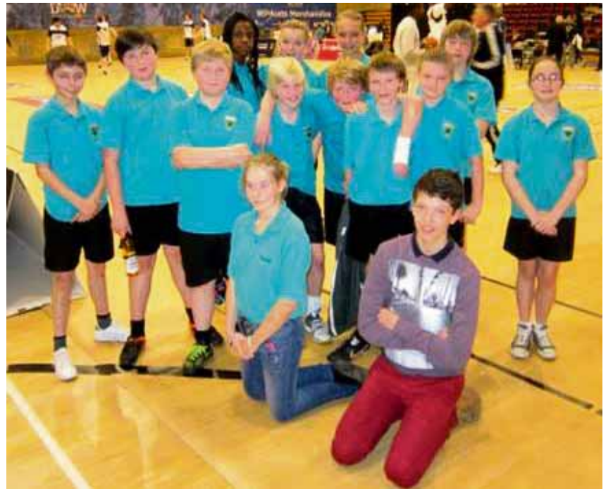
Greenfield College Basketball Academy Team

Thank you again to the Wildcats for giving up their time to organise this event and for the invite to watch a first class game against