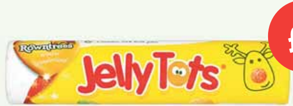
Rowntrees Jelly Tots Tube 130g