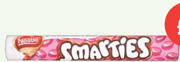
Smarties Pink Tube 170g