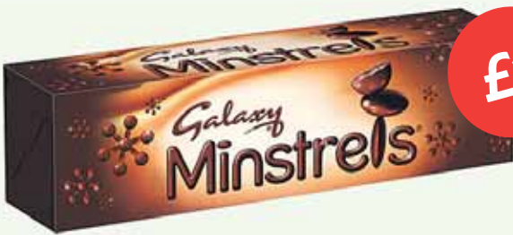
Galaxy Minstrels Tube 126g