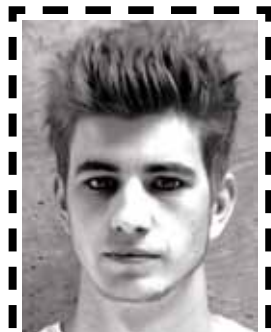
Stockists of American Crew

All proceeds will go to the residents fund and help towards setting up a Sensory Unit for residents. Please come and support us.