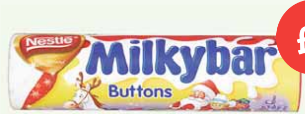
Nestle Milky Bar Button Tube 92g