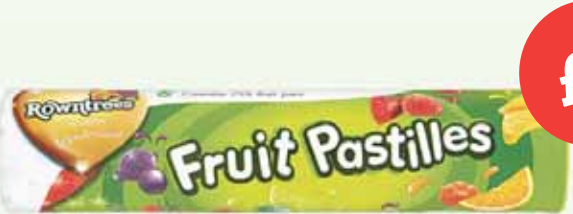
Rowntrees Fruit Pastilles Tube 125g

Tesco Extra Newton Aycliffe Greenwell Road, Newton Aycliffe DL5 4DH Open Mon 6am-Sat 11:59pm, Sun 10am-4pm