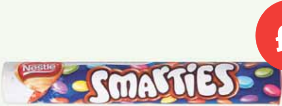
Nestle Smarties Tube 170g