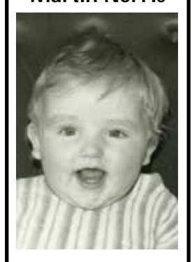
Happy 40th Birthday You've changed a bit! Love from Mum Dad and Family