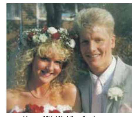
Happy 25th Wedding Anniversary

24th October 1987 Congratulations to a special Daughter and Son-in-Law, wish you both all the happiness for your future together. Love, Mam and Dad xxxx Happy 25th Wedding Anniversary