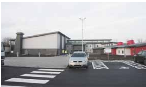
An exterior view of the Xcel Centre from the large car park

The Rotary Club warmly invite residents to attend this 20th Community Sing Along. Admission is free, but there will be a valuable raffle and a retiring collection for needy families and our soldiers in Iraq and Afghanistan. Please come - everyone welcome.