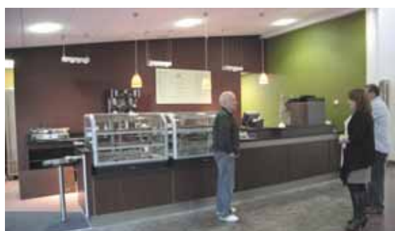
One of the refreshment points selling Starbucks Coffee