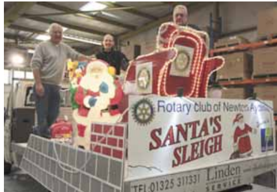
The vehicle for the sleigh was donated by Linden Group

Around 50 hampers are distributed at Christmas for those families in the town going through difficult times. This weekend the club starts its collections in Tesco's.