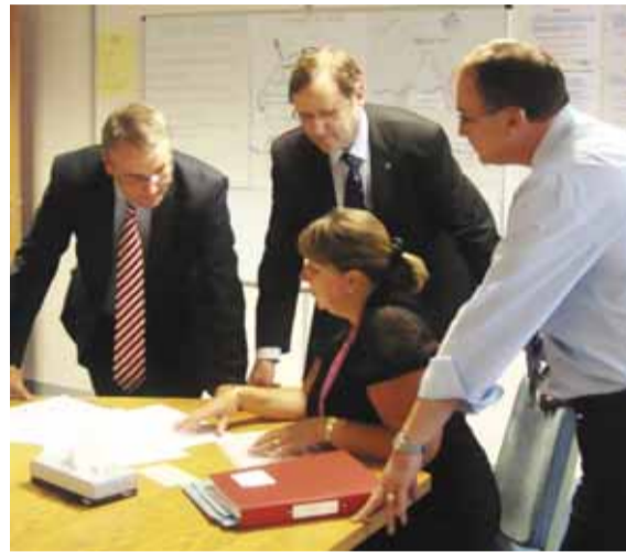
Alan Campbell MP, Parliamentary under Secretary of State and Phil Wilson MP meet with the staff at the Sedgefield Community Drugs Centre in Newton Aycliffe.

Alan Campbell MP Parliamentary under Secretary of State at the Home Office and Phil Wilson MP visited The Sedgefield Community Drugs Service situated in Thames House in Newton Aycliffe to see the work that is ongoing there. Mr Campbell said "The kind of work taking place here is vital to keeping people in the process of breaking their drugs habit. It complements the government's stance of both recognising the need to help people with a drugs problem and coming down hard on drug related crime" Wilson MP for Sedgefield said "The work being done by the drug rehabilitation team here is first class. I was particularly impressed by their sheer dedication to finding solutions to the difficult problems drug abuse brings to individuals. As the Minister said the approach on being tough on drug crime and offering support for people who have become addicted is the right way to tackle this problem".