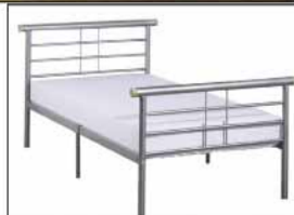
Single metal bed frame £65, double £80