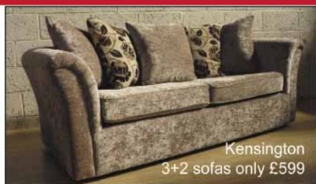
Kensington 3+2 sofas only £599