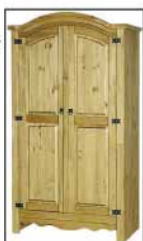
Mexican 2 door wardrobe £150

Just in - 4ft6 divan bed complete with ortho mattress only £150