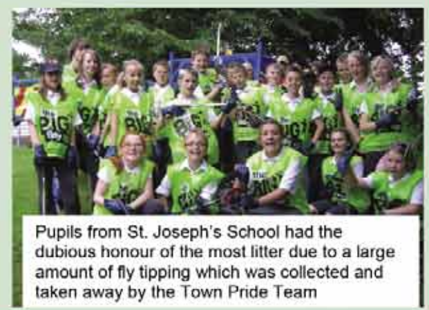
Pupils from St. Joseph's School had the dubious honour of the most litter due to a large amount of fly tipping which was collected and taken away by the Town Pride Team

Youth Councillors attend local PACT meetings whenever possible so if you are a young person and have an issue you would like to raise at these meetings contact your local youth councillor. Their details will be published in our next issue. However, your school will have their information shortly.