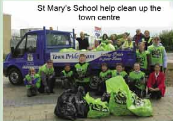
St Mary's School help clean up the town centre