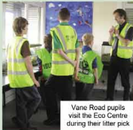
Vane Road pupils visit the Eco Centre during their litter pick