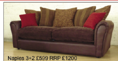
Naples 3+2 £599 RRP £1200

Just in - 4ft6 divan bed complete with ortho mattress only £150