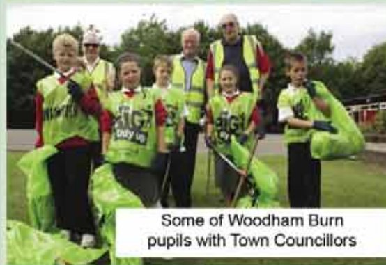
Some of Woodham Burn pupils with Town Councillors