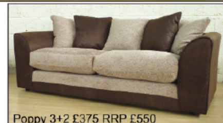
Poppy 3+2 £375 RRP £550