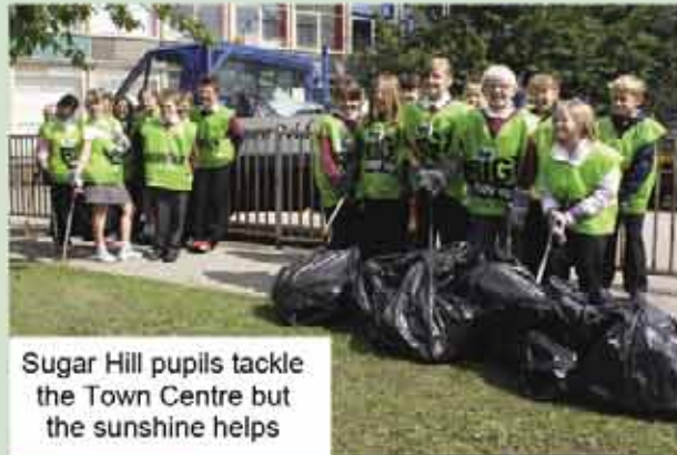
Sugar Hill pupils tackle the Town Centre but the sunshine helps