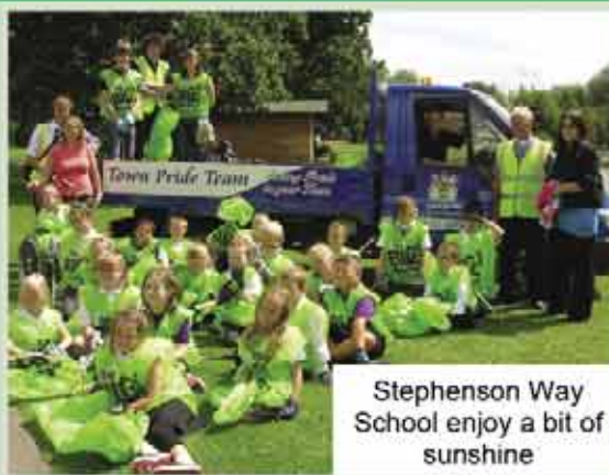
Stephenson Way School enjoy a bit of sunshine

Aycliffe Youth Council and The Town Council want to thank everyone who lent their support to this very successful campaign. A special thank you to Sterling Safety Services who donated protective equipment for the events.