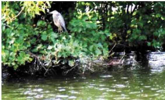
A Heron spotted on the Lake by a reader