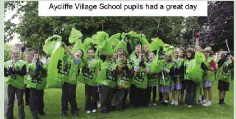
Aycliffe Village School pupils had a great day

Youth Councillors attend local PACT meetings whenever possible so if you are a young person and have an issue you would like to raise at these meetings contact your local youth councillor. Their details will be published in our next issue. However, your school will have their information shortly.