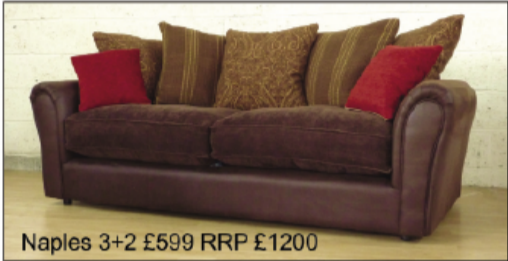
Naples 3+2 £599 RRP £1200

Just in - 4ft6 divan bed complete with ortho mattress only £150