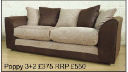
Poppy 3+2 £375 RRP £550