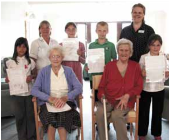
Aycliffe Care Home near to St. Francis School have a good relationship with the students and recently held a Poetry Competition for the children. The winners are shown with the Manager and two residents.