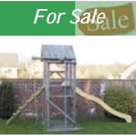
WOODEN playframe including slide, pole, rock climb, rope and ladders, great fun for the kids. £200 Tel 307530