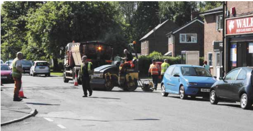
Replaced with much lower and gentle hump

Motorists Claims of Wrong Height Justified