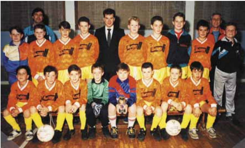
The First Youthy Football Team - Where are they now?