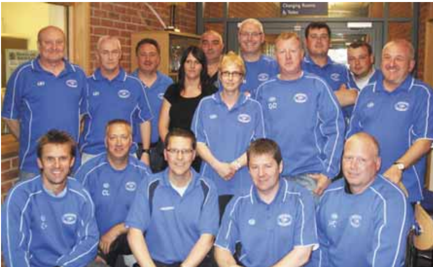
The Youthy Football Club Management Team