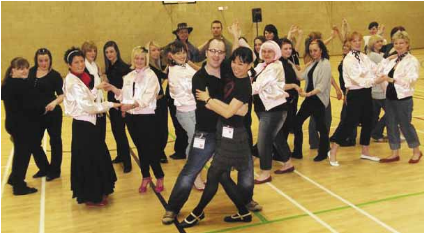
Students & staff at Bishop Auckland College enjoying learning how to dance Lindy Jazz

The next PACT meeting for the West Ward is at 7pm on Tuesday 2nd June 2009 at Burnhill Way Methodist Church.