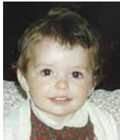
Happy 21st Birthday 13th May 2009