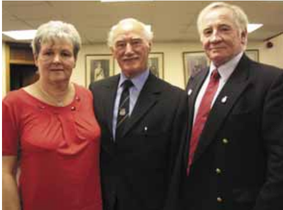
Charity Recipients of £8,000