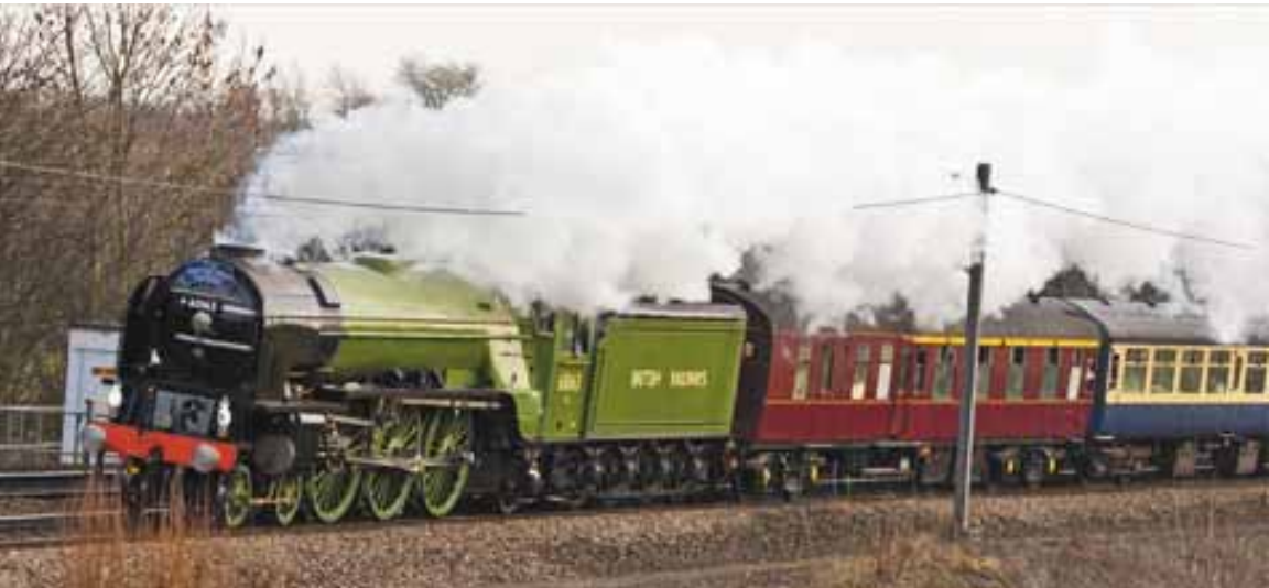
Local Photographers “Eye Dream” caught the new steam locomotion, built at Darlington approaching Aycliffe on the main North East line on Saturday 31st January 2009 around 1 p.m.. A superb shot capturing the train in motion. Eye Dream can be contacted on 07595 023823.