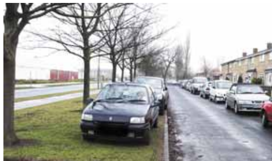
Street packed with cars

The newly formed Residents Association are hoping to resolve this problem and bring relief to those living in the street. They are making representations to the local Authority and the Police.