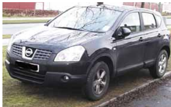
Parked cars damaging the grass