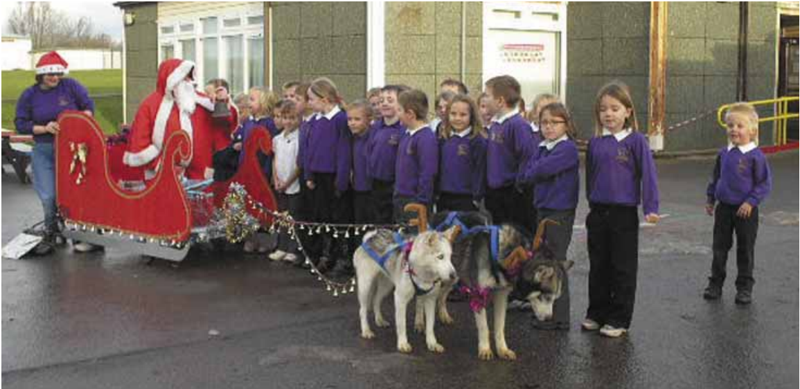
Stephenson Way Comunity Primary School had a visit from Santa, pulled on his sleigh by 2 Siberian Huskys dressed as reindeer. Father Christmas handed out presents to the toddler group, and everyone enjoyed a stroke and cuddle from the dogdeer! A fantastic morning enjoyed by everyone.