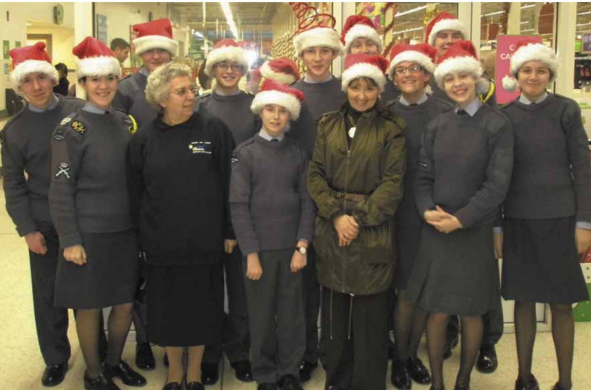
Air Force Cadets from Newton Aycliffe got together with Butterwick Hospice at Bishop Auckland to raise much needed funds. Asda customers paid a donation in return for having their shopping bags packed and a grand total of £1500 was raised which is a great boost at this time of year. Asda were pleased to allow this event to help such a good cause.