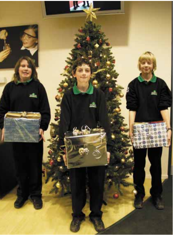
Three of the students who helped make up Christmas Hampers for nearby residents of Woodham Technology College. Each year children make up a number of hampers to deliver personally.